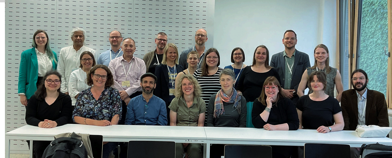
Working Group on Archives at the SIEF2023 16 th Congress in Brno, Czech Republic

The SIEF Working Group on Archives is a network between ethnographic archives, between scholars working in these archives, and scholars working on them.